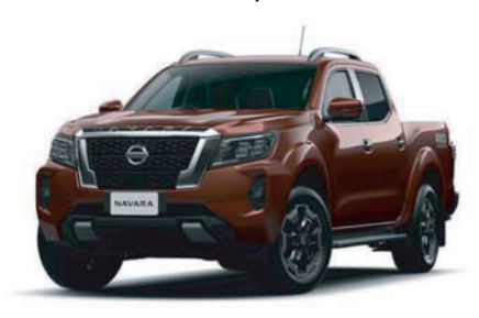
Forged Copper (MT Only)