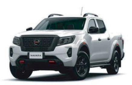
Aspen Pearl White