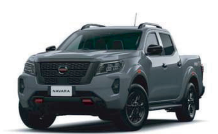
Stealth Pearl Gray