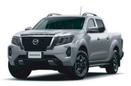
Brilliant Silver (MT Only)